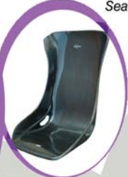
'Mulsanne C' Carbon Fibre Seat with Cushion Kit & Composite Subframe.