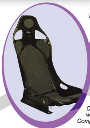
'Mulsanne C' Low Back Seat.